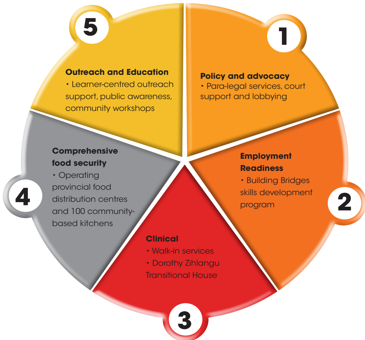
Figure 2: Programme Implementation

The organisation's programs are managed and supervised by skilled and experienced professionals who are technically equipped in multiple areas including programme management in psychosocial support, emergency accommodation, law, skills development, food security and public relations.