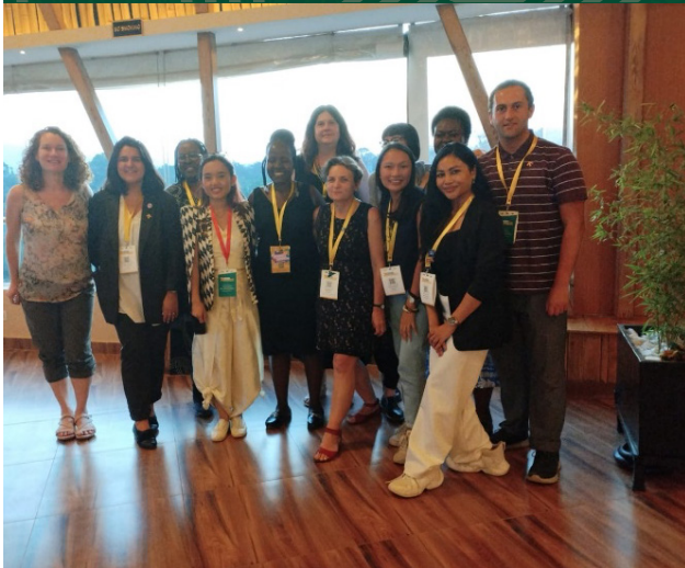
Figure 3: Meet Up on Prevent Online GBV, the Hut Restaurant & Boutique Hotel, Kigali