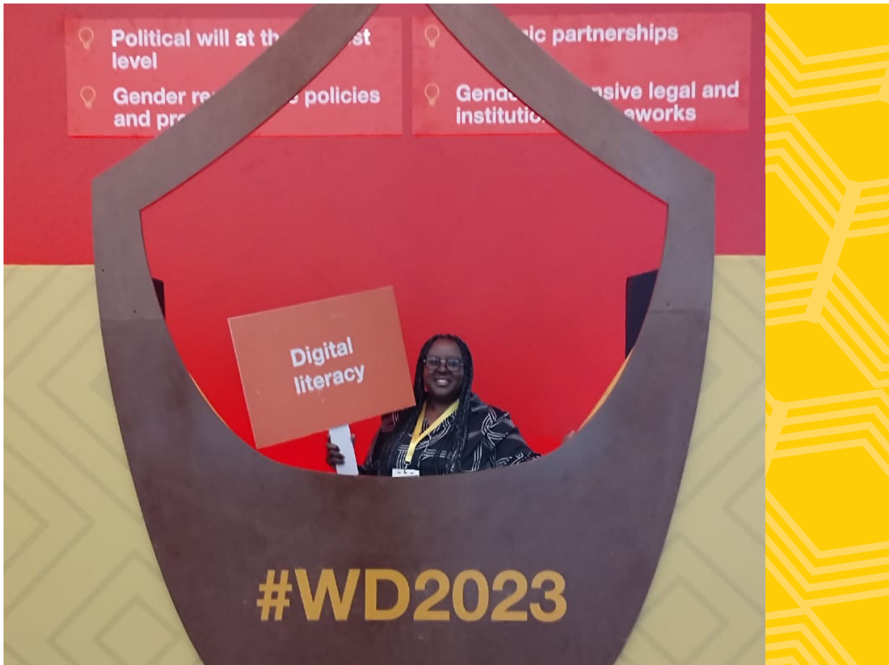
Figure 2: Call for Digital Literacy & Education