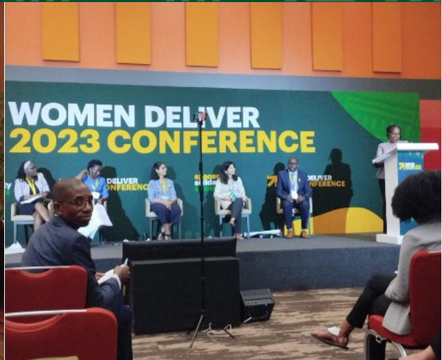
Figure 4: Concurrent session: African Feminist Perspectives on Wellbeing: Cultural Meanings, Identities & Innovations

The Ilitha Labantu delegate also attended Meet Up event on “Prevent Online GBV” AND “African Feminist Perspectives on Well-being: Cultural meanings, Identities and Innovations”