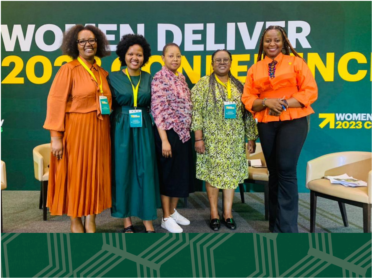
Figure 1: Panel on "Women and ICT to end violence against women and girls"

The session addressed access to the internet and the pros and cons of this. It was highlighted that as much as the internet has become an integral part of our lives, and provided opportunities for communication, education and connection. It also opened a whole dark world of cyberbullying, revenge porn, online grooming and other forms harassment and exploitation.